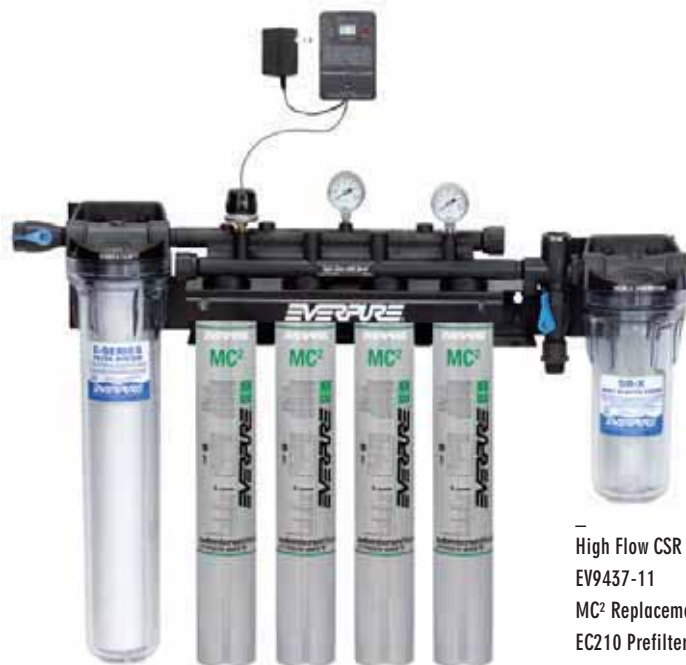
— High Flow CSR Quad-MC 2 System with LPA: EV9437-11 MC 2 Replacement Cartridge: EV9612-56 EC210 Prefilter Cartridge: EV9534-26 SS-IMF Cartridge: EV9799-32

NSF Certified under NSF/ANSI Standards 42 and 53